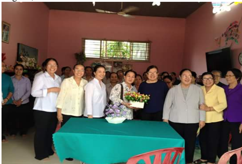
With HCM & Dong Nai Centers' members

I am so thankful to be given this opportunity to bond with our Vietnamese members as well as to members of other SIs in Vietnam. It was so heart warming that despite language barriers, we all try our very best to understand each other, thru warm gestures and welcoming friendly attitudes. I hope in the near future, they will be conversant with English, similar with the members of other SIs I met there.